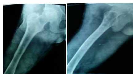
Fig 4: After Implant Removal

He developed insidious pain in the right hip which was dull aching, localized pain which increased on walking long distance and was relieved at rest. There was no history of any diurnal variation, any waxing or waning of symptoms, no history of any other trauma, no history of fever, no history of steroid, tobacco consumption or alcohol consumption. The pain increased in intensity and for the same he started pain medications which relieved the symptoms partially. He presented to us with pain on terminal motion of the right hip which affected his activities of daily living. On examination he had a surgical scar over the lateral aspect of the hip with tenderness over the right hip, the