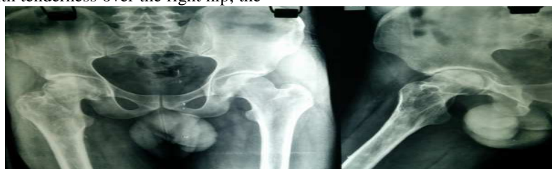
Fig 5: Presented to us with Right Hip pain

Range of motion of the right hip were only terminally restricted with sectoral sign being positive. He was investigated in the form of standard radiographs and MRI which showed Grade 3 AVN. All other blood investigation was within normal limit. He was started on alendronate 70mg once a week and analgesics for the pain as the patient was unwilling for any surgical intervention and on the last follow up the patient was not on any analgesics and continuing the use of alendronate, the patient was pain free.