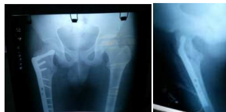
Fig 2: Immediate Post-Op