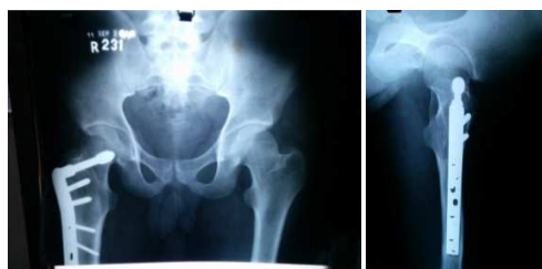
Fig 3: Follow-Up Radiographs