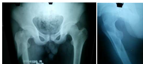
Fig 1: Radiograph after Trauma

form of standard radiographs and MRI which showed Grade 3 AVN. All other blood investigation was within normal limit. He was started on alendronate 70mg once a week and analgesics for the pain as the patient was unwilling for any surgical intervention and on the last follow up the patient was not on any analgesics and continuing the use of alendronate, the patient was pain free.